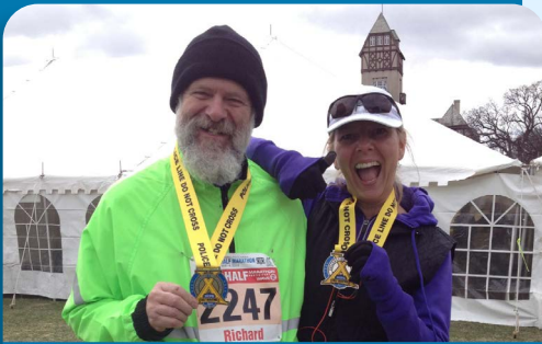
6.5 MILES FOR 65 YEARS